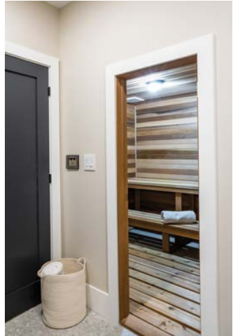
Every room appeals to David. "I love the whole house," he says. "Whether I'm watching television in the bedroom or sitting in front of the fireplace in the great room, it's all amazing." OH