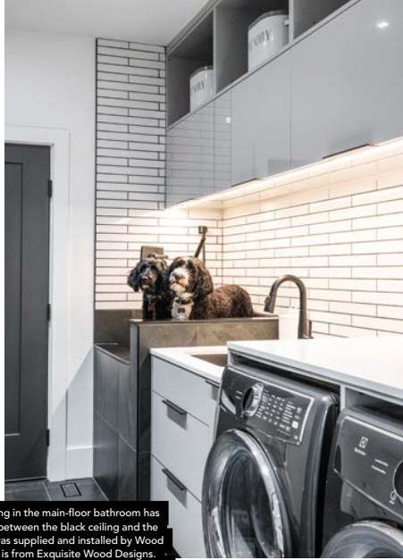
TOP & BOTTOM LEFT: The ceiling in the main-floor bathroom has a gold trim that defines the line between the black ceiling and the white walls. Trim for the project was supplied and installed by Wood & Wallworks. The custom vanity is from Exquisite Wood Designs. TOP RIGHT: Cosmo and Cooper wait in the dog shower to have their feet rinsed. Cabinetry from Exquisite Wood Designs is topped with Caesarstone quartz. BOTTOM RIGHT: A guest bedroom on the main level at the front of the home is a welcoming oasis. Flooring for the home is Craft White Oak eight-inch-wide plank and was sourced through House Rules Design Shop. Security for the home was supplied and installed by Georgian Bay Fire & Safety Ltd.