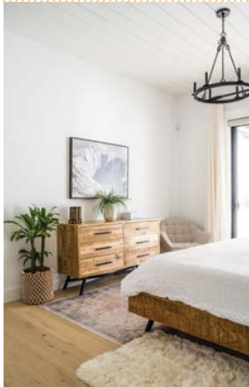
ABOVE: The accent wall in the primary bedroom is Benjamin Moore Boothbay Gray. The distressed wood bedframe and the side tables add a natural element. TOP RIGHT: A velvet stool in the primary en suite sits at the makeup counter, while a round silver tray holds perfume bottles. Interior doors were sourced at Miller's Home Hardware Building Centre and installed by Wood and Wallworks. RIGHT: A chest of drawers in the primary bedroom offers extra storage and matches the bedside tables. A plush sheepskin rug is layered on top of the large area rug. FAR RIGHT: The white oak double vanity in the primary en suite has a quartz countertop. The vessel tub sits on heated tile flooring – Urban Zebra Metal Art in Black, sourced from Complete Flooring.