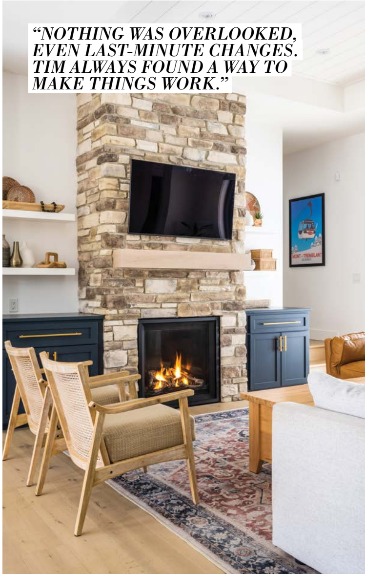
LEFT: The impressive stone fireplace is flanked by closed cabinetry painted Benjamin Moore Blue Note. Floating shelves display textural décor. Audio for the home was installed by Balaklava Audio. The gas fireplace was supplied by The Fyre Place and Patio Shop.

“NOTHING WAS OVERLOOKED, EVEN LAST-MINUTE CHANGES. TIM ALWAYS FOUND A WAY TO MAKE THINGS WORK.”