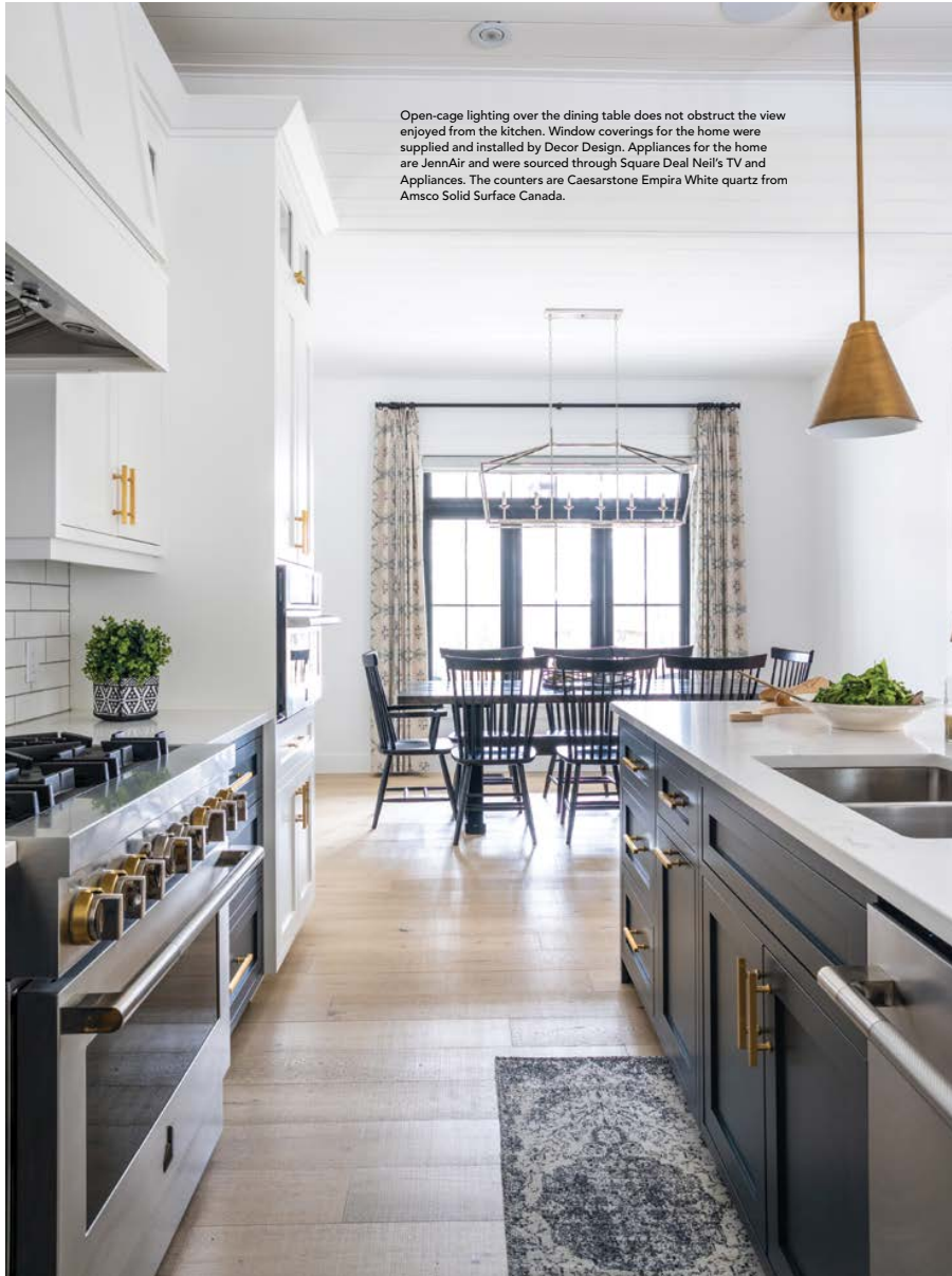
Open-cage lighting over the dining table does not obstruct the view enjoyed from the kitchen. Window coverings for the home were supplied and installed by Decor Design. Appliances for the home are JennAir and were sourced through Square Deal Neil's TV and Appliances. The counters are Caesarstone Empira White quartz from Amsco Solid Surface Canada.