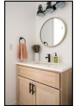
ABOVE: The white oak vanity in the main-floor powder room is topped with Caesarstone Empira White quartz. Plumbing fixtures for the home were supplied by Acton's Plumbing and Heating Inc.

ABOVE: Flooring throughout the home is Grandeur Enterprise Collection in Stratus oak, supplied by Floorcrafters. Ship lap on the ceiling adds another design element to the dining area. Electrical for the project was installed by LDS Electrical. RIGHT: Urban Zebra Metal Art tile in black is laid in a herringbone pattern in the combination mudroom/laundry. Bench seating, lots of hooks for raincoats and upper cubbies keep this area organized for the family. Trim for the project was installed by Wood and Wallworks. The counter over the washer and dryer is Silestone Snowy Ibiza from Amsco Solid Surface Canada.