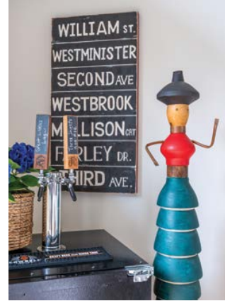
ABOVE: A sign above the keg fridge shows the number of moves the family has made over the years. BELOW: The main-level powder room has a soapstone vessel sink and three-dimensional flooring mimicked in the art hanging on the wall. All tile and flooring was sourced through House Rules Design Shop.

Situated in an ideal location, the wet bar tucks in underneath the modern stainless steel and glass staircase to the second floor. Accented with leathered granite counters from The Old Barn (purchased through House Rules Design Shop) and boasting a wine fridge, the space provides function with flair. The glass-and-steel staircase maintains the feeling of wide-open spaces.