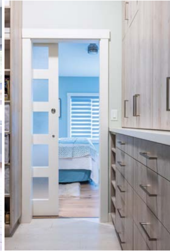
ABOVE: On the main level, the primary bedroom's king size bed is layered with lightweight quilts that coordinate with the Bay Of Fundy paint colour on the walls. Engineered hand-scraped white oak flooring continues from the living room. ABOVE RIGHT: The primary closet sits between the bedroom and en suite. Cabinetry was completed by Chevin Kitchen & Bath Inc. RIGHT: A high window over the en suite vessel tub has a shutter covering, with the louvers running vertically instead of horizontally. BELOW LEFT: The en suite's curbless, walk-in shower tile combines glass and porcelain into an interesting and colourful design. BELOW RIGHT: A corner of the primary bedroom is surrounded by windows that frame the Lake Huron view. There is also a door to the back deck for enjoying morning coffees.